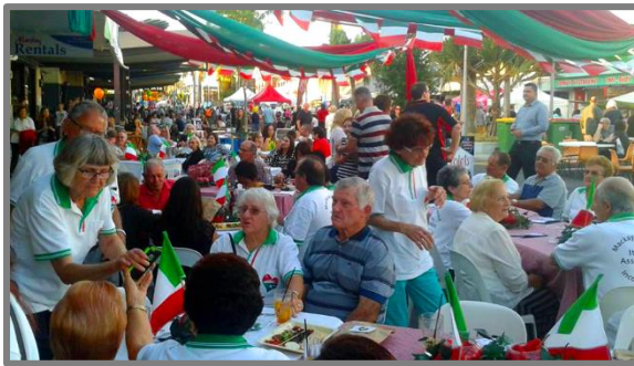
Taste of Little Italy